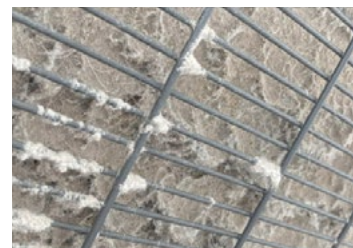
Severely Neglected Condenser Coil